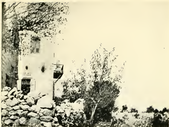
ABDUL BAHÁ ON THE BALCONY OF THE HOUSE ON MOUNT CARMEL